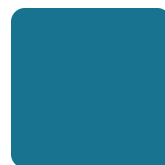
12058 Mosaic Blue