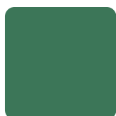
12062 Kelly Green